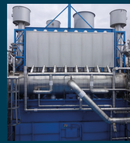
Secondary steam separation in bottles outside drum