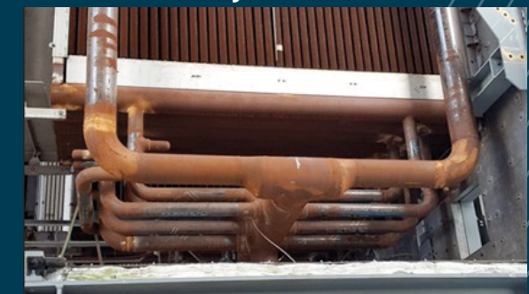
Multiple inside downcomers Expansion loops in EVAP feeder Bundle spring supported